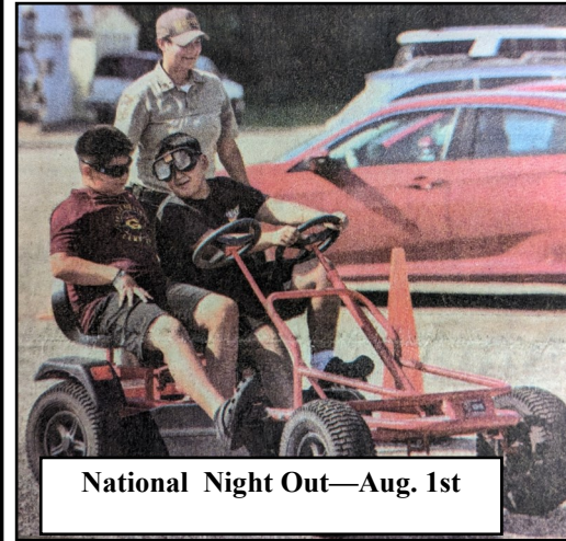
National Night Out—Aug. 1st

The Walsh County Health District has been able to support and help organize some family engagement events over the last few months. These family engagement events served as opportunities to facilitate education and conversations with families about underage drinking and being a positive model. Through our Substance Use Prevention, Treatment, and Recovery Services (SUPTRS) Block Grant, we were able to support these events and provide alcohol free family events in Walsh County with the goal of decreasing underage drinking