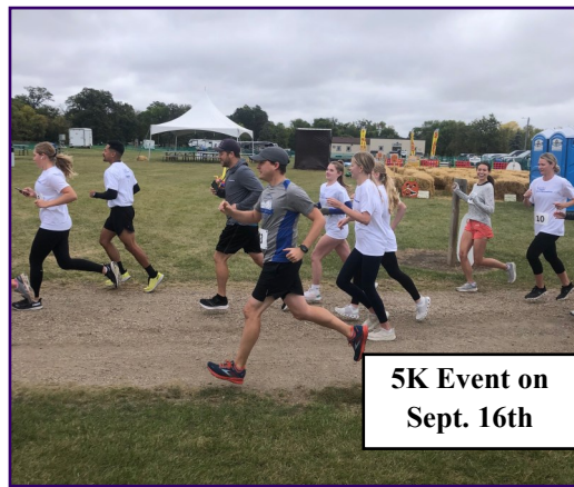
5K Event on Sept. 16th

The Walsh County Health District has been able to support and help organize some family engagement events over the last few months. These family engagement events served as opportunities to facilitate education and conversations with families about underage drinking and being a positive model. Through our Substance Use Prevention, Treatment, and Recovery Services (SUPTRS) Block Grant, we were able to support these events and provide alcohol free family events in Walsh County with the goal of decreasing underage drinking